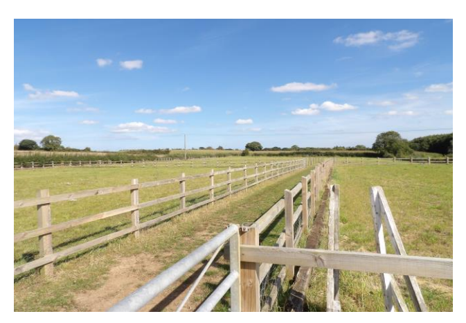
Aldeby Ark Stables East End Lane Beccles NR34 0BF

3.55 Acres sts with paddocks, refuge/tack room, stable block, menage, 12 volt solar panels and rain water harvesting